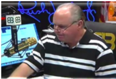
Talk-radio host Rush Limbaugh

With a large audience of conservative listeners, the radio reactionary was once able to intimidate Republican politicians into defending his outrageous comments or publicly apologizing to him if they dared voice even the mildest criticism. He was invited to speak to gatherings of GOP pols and activists, who took Limbaugh's advice in order to gain his favor and avoid his vitriol.