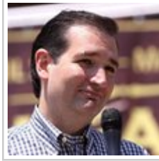
Ongoing Conservative Delusions