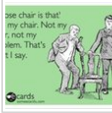
How Romney Brilliantly Summed Up GOP Ideology in a Single Sentence