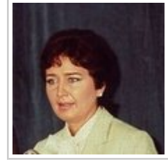
Once Again, Obama Does Something No GOP President Bothers to Do