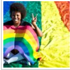
All Tomorrow's Parties