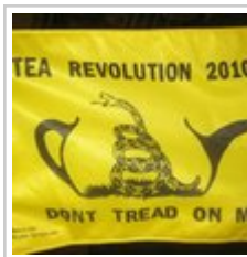
Three New Facts about the Tea Party