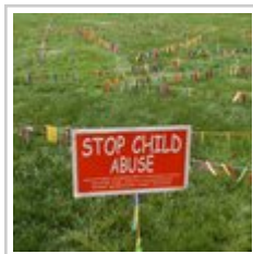
The Gay Recruiting Myth Dies a Quiet Death