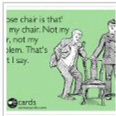
How Romney Brilliantly Summed Up GOP Ideology in a Single Sentence