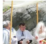
Conversion celebration takes a surprise turn — into a wedding