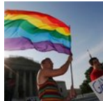
Supreme Court issues two major rulings expanding gay rights