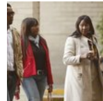
Mandela family's message to Jews