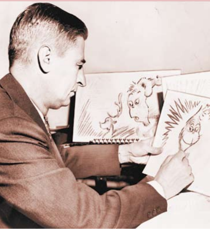
Theodor Geisel works on a drawing for How the Grinch Stole Christmas.

(and Hitler booster) Charles Lindbergh and right-wing radio priest Father Charles Coughlin—both of whom were anti-Semites—and Senator Gerald Nye of North Dakota, an isolationist leader.